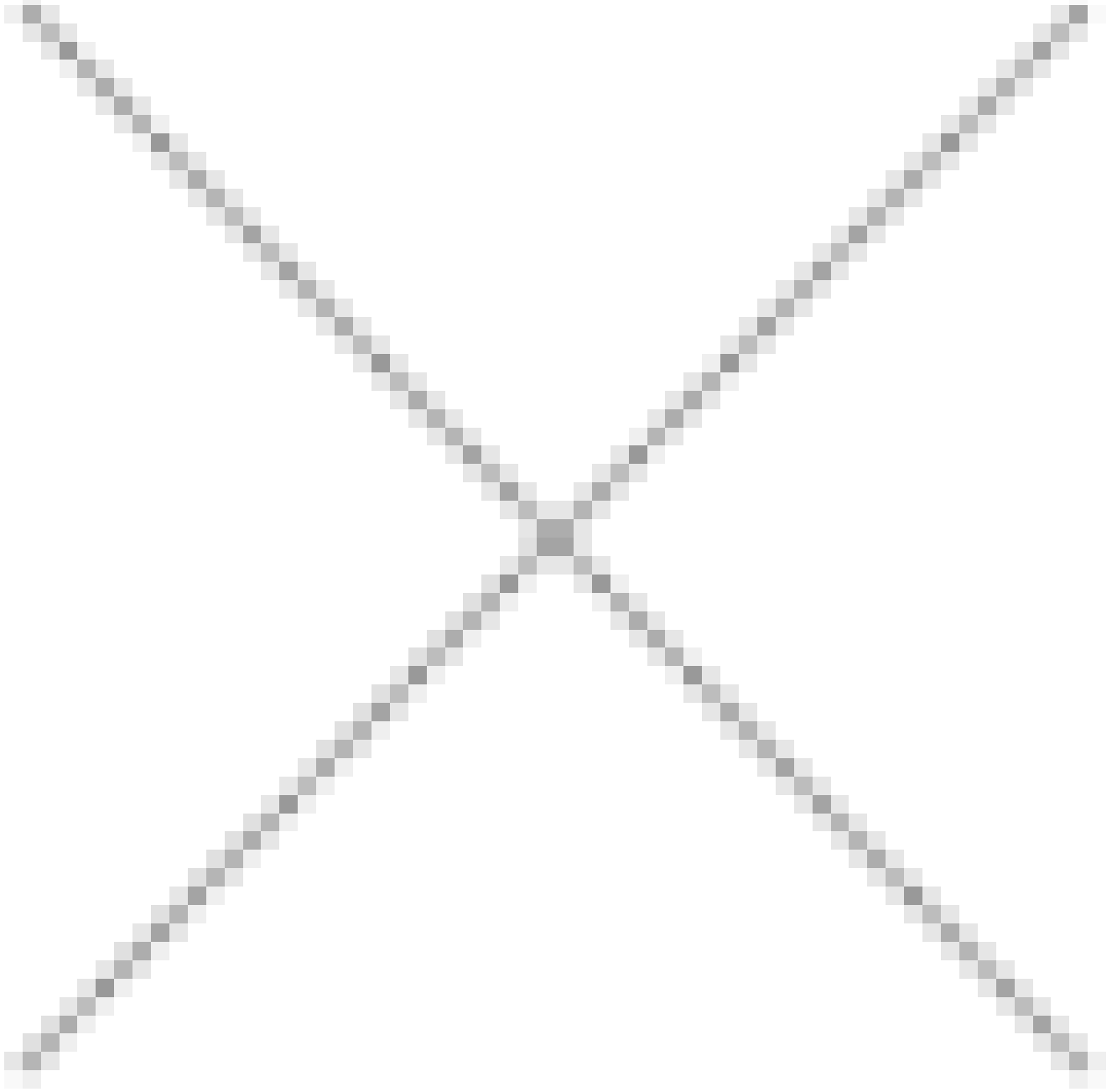
Image not readable or empty /home/mcxsd05/domains/heritage-mercury.net/public_html/base/components/com_rsform/uploads/628b750e83aeb-6